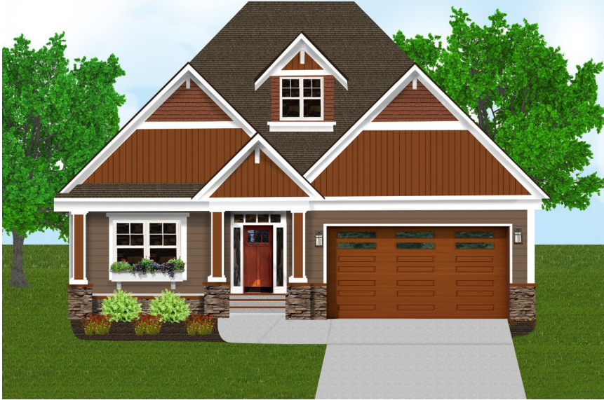
*Rendering contains optional features*